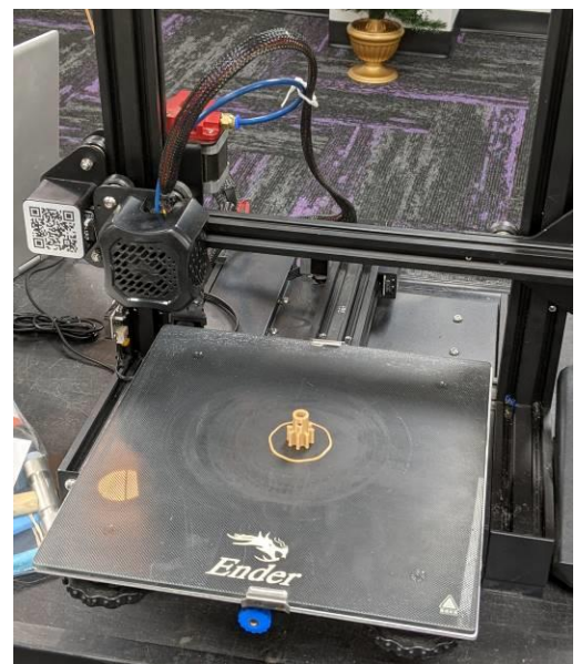
3D Printed Clock Gear