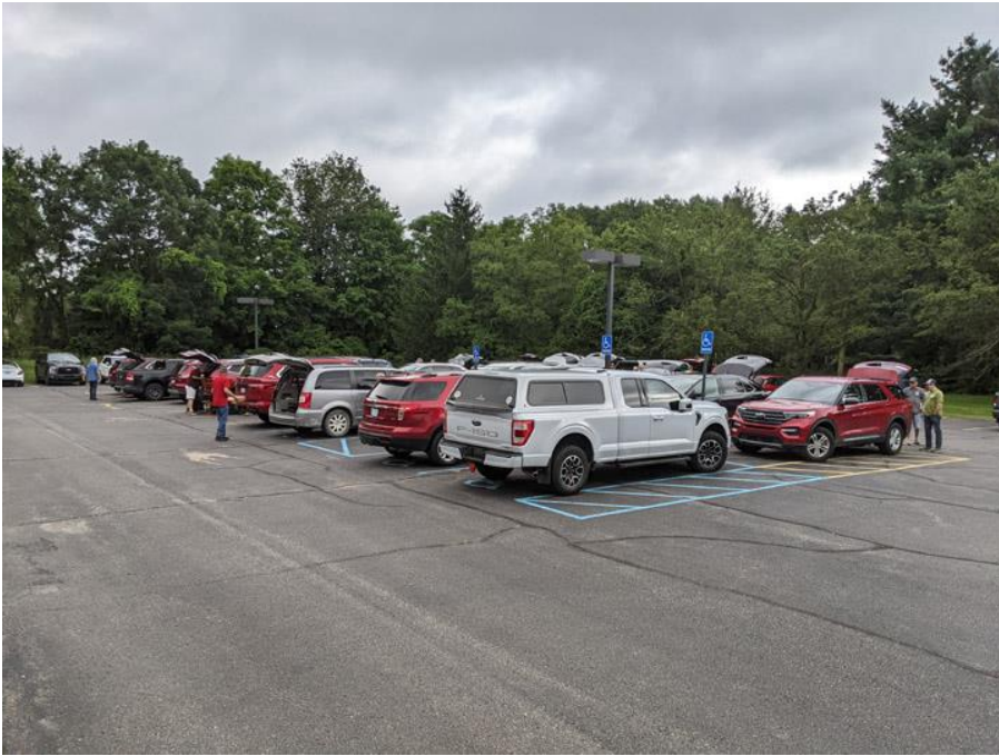
Foreboding Skys, but It Didn't Rain for the Tailgate