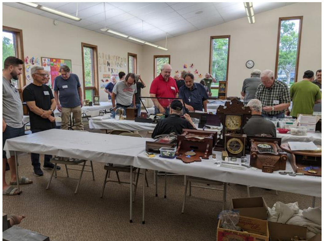
The Mart Begins to Fill Up