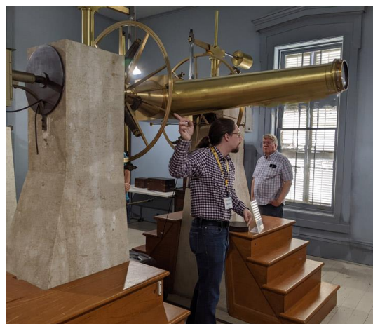
The Meridian Circle