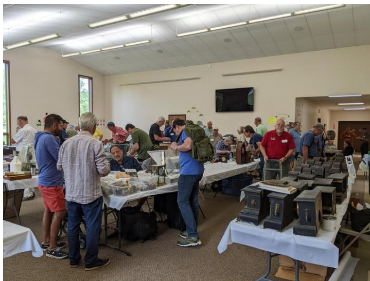
All Michigan Meeting Mart Room