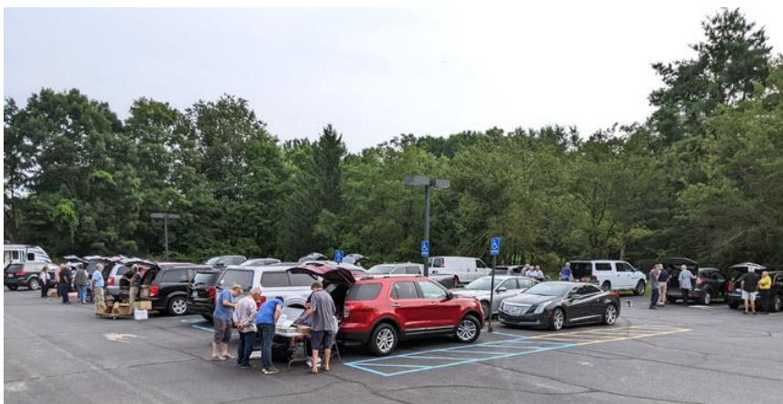
All Michigan Meeting Tailgate