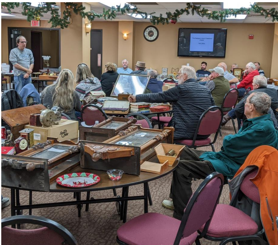
A Full Mart Room at the Masonic Lodge