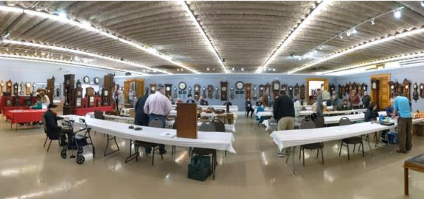
Chapter Meeting in Schmidt's Auction Room