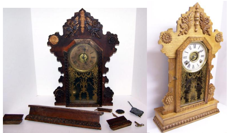
1991 Gilbert "Citizen" Clock Before and After Restoration