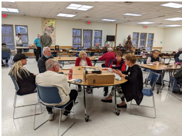
Chapter Roundtable Discussion

Here are a few more pictures from the December meeting.