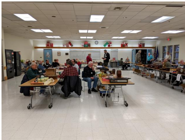
Many Items for Sale in the Mart