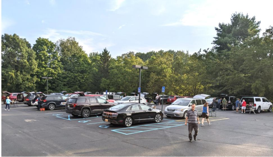
Tailgate in Progress