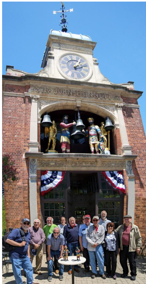
Members at the Sir John Bennett Clock