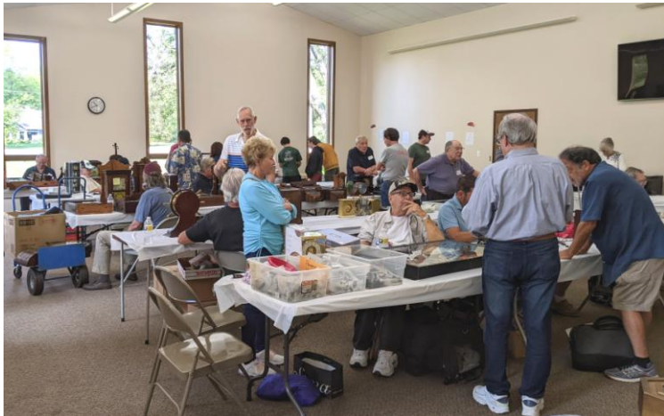
A Busy Mart