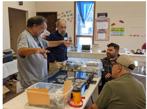
An intense discussion at one of the watch tables