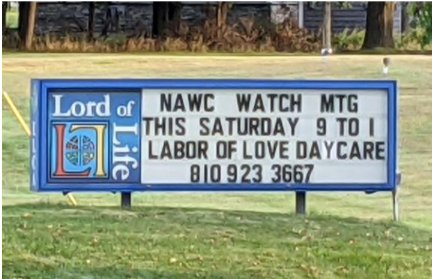
Not enough “C’s” for the sign