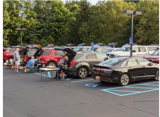
A busy tailgate