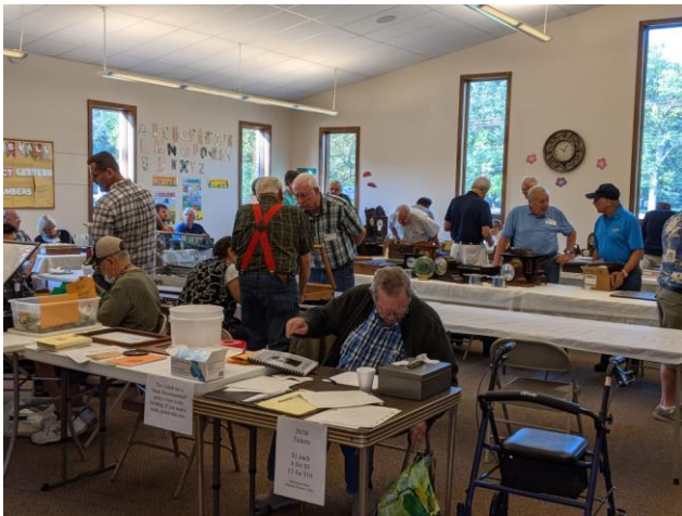
A busy Mart