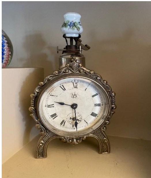
“Firebug”- Very Appropriate Name! Circa 1880 American E. N. Welch Manufacturing Co. 30-hour Matchlight Alarm Clock