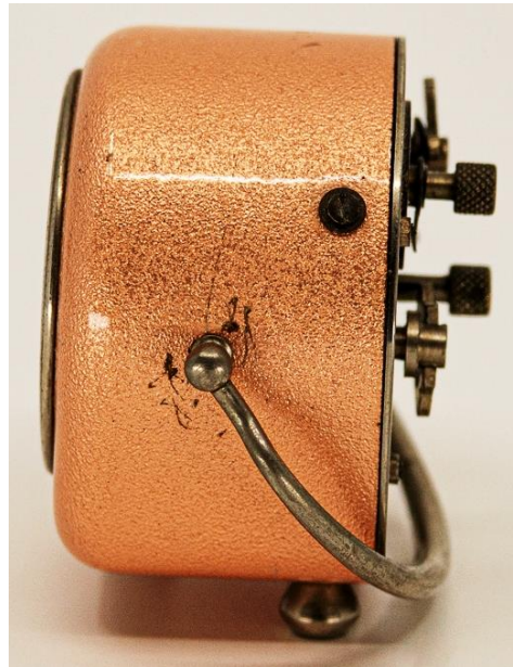
A cute little alarm By Junghans $30.00