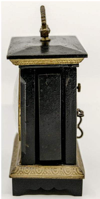
Black Cast Iron Maker Unknown $40.00