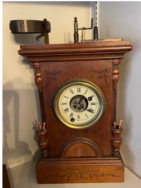
Ansonia Brass & Copper Co., Ansonia, Conn., 30-hour, time and alarm spring brass movement. "H.J. Davies Patent Matchstick Illuminated Alarm" C.1875 Manufactured by B. Bradley & Co. Boston, MA