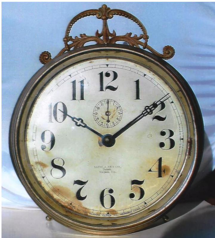
Parker Alarm Clock

I was at an Estate sale and bought these two alarm clocks.