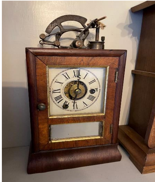
Seth Thomas Clock Co., Plymouth Hollow, Conn., circa 1860, 30-hour time/alarm "Procter's patent Burglar and Fire-Detective Clock"