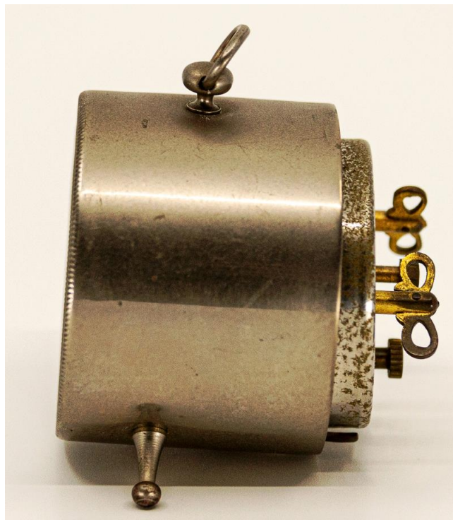
A Junior Tattoo by New Haven $25.00