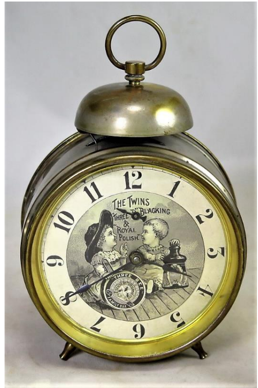
Bixby & Company Ca 1910