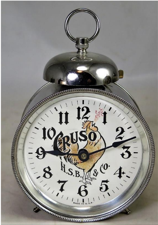
Became True Value Hardware In 1962