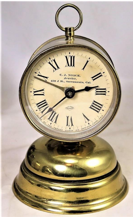
Jeweler in Sacramento, CA