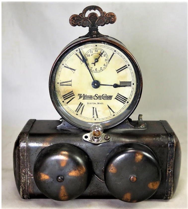
Early Lehman Brothers Financial