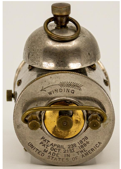
ANSONIA BEE ALARM with THE ORIGINAL BOX