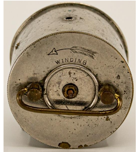
ANSONIA RIM WIND