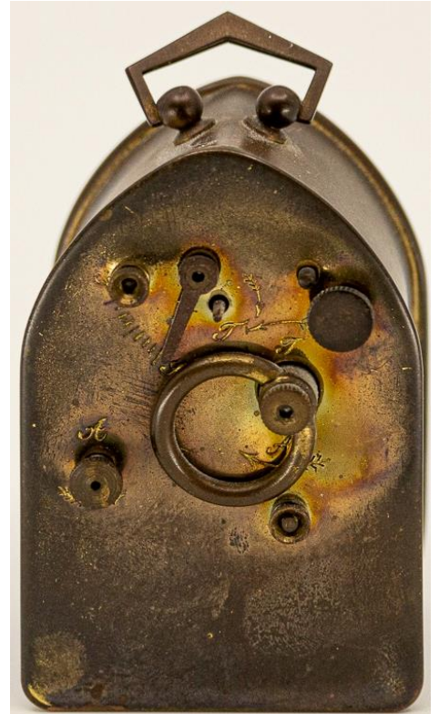
SMALL BRASS ALARM (probably German)