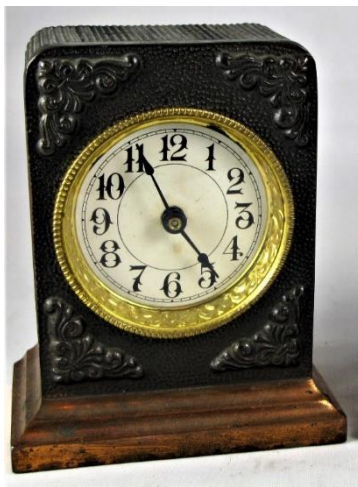
Westclox "IRONCLAD" Alarm" $45 + $15 shipping