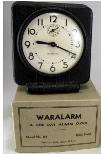
"WARALARM" in Original box in Original Box $45 + $15 shipping