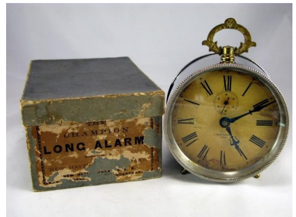
New Haven "Champion Long $45 + $15 shipping

Contact Vince Angell for condition and more pictures if needed.