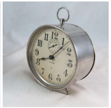
Ansonia "Clatter" Ca. 1910 $32.00 + $13.00 Shipping