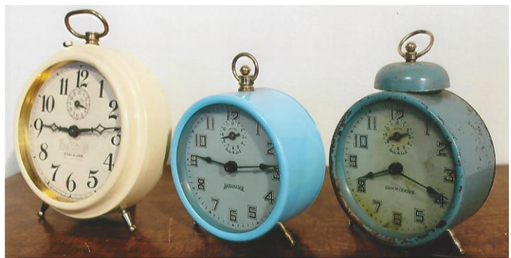
8 Day National Call Ingram Ambassador Commadore