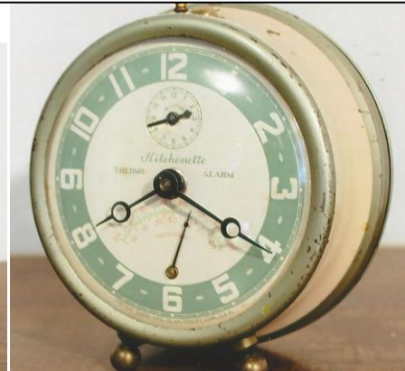
Lux Kitchenette Thermo Alarm