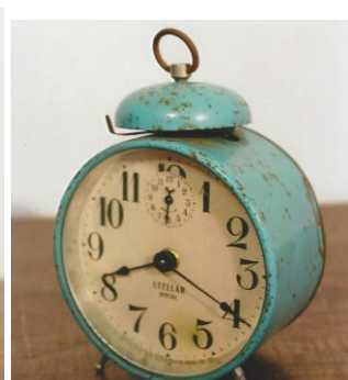
Waterbury Stellar Special