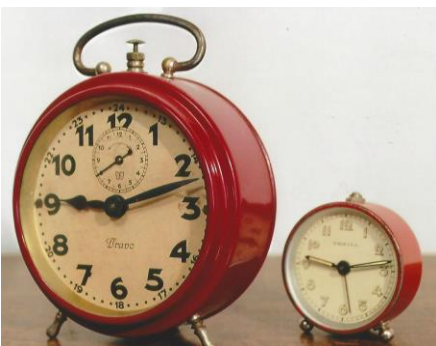
Junghans Bravo Unkown Mfg Thrill