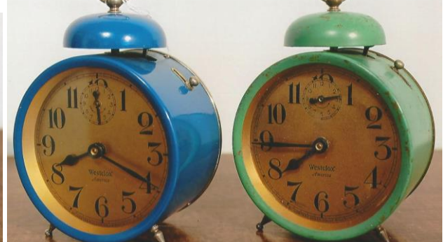
America Westclox America