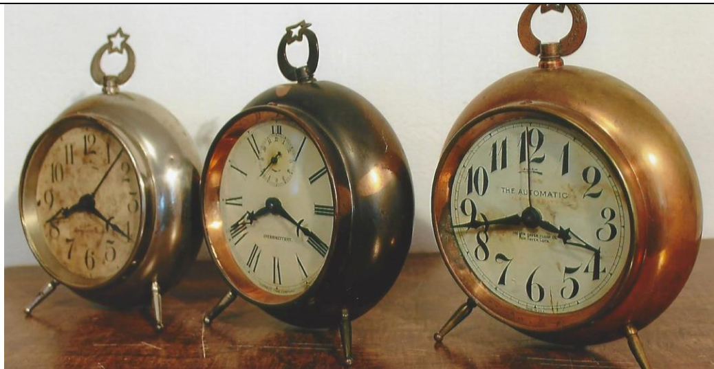
And let's not forget about New Haven with their finishes Nickle Antique Bronze Copper

All are Automatic Alarm with luminous dials