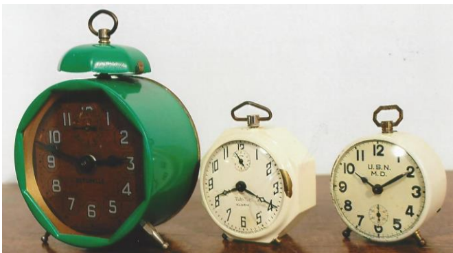
New Haven Octobell (gold Dial) Tidy Tot U.S.N. M.D.