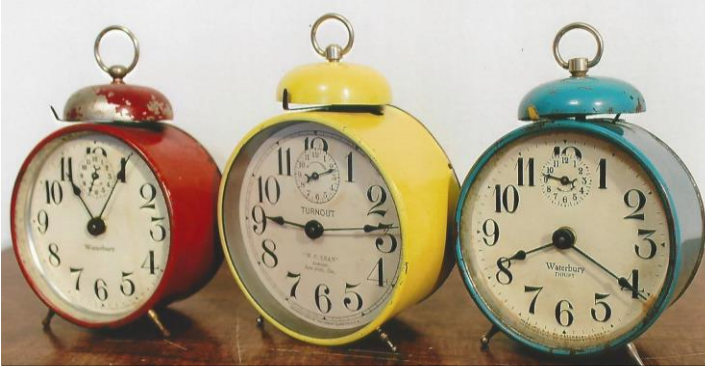
Private Label Waterbury Private label Thrift