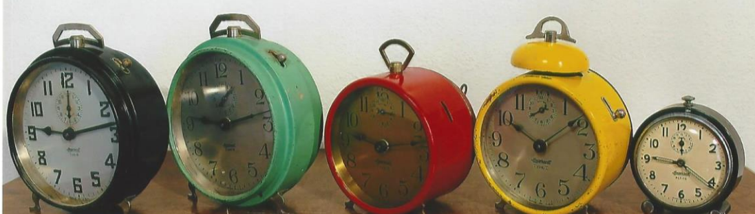
Type R Type R Ingersoll Type S Type S (Gold Dial) Petite