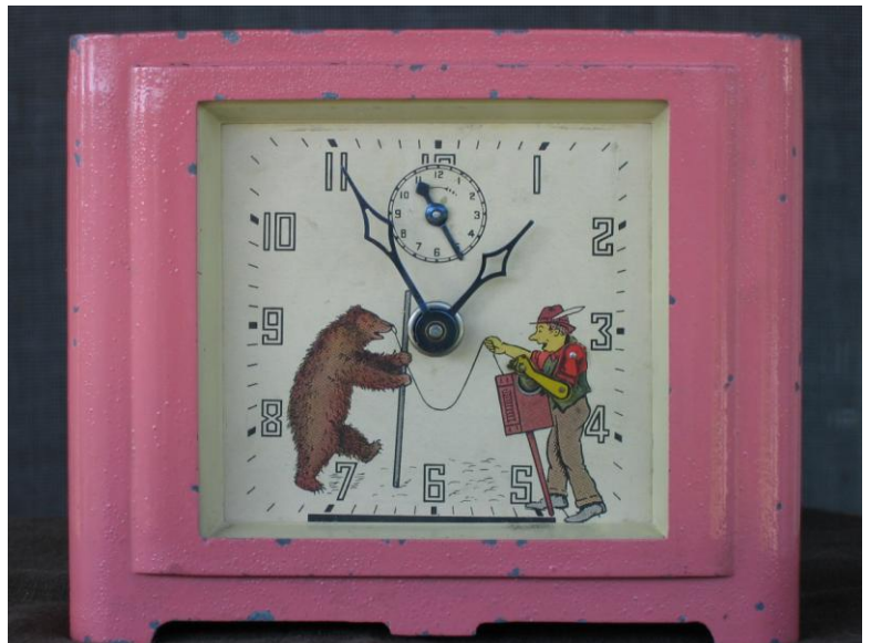
Two Organ Grinder Alarms. One with a monkey and the other with a Bear. Both by Lux. Looks like the same Organ Grinder though. Both are LUX clocks