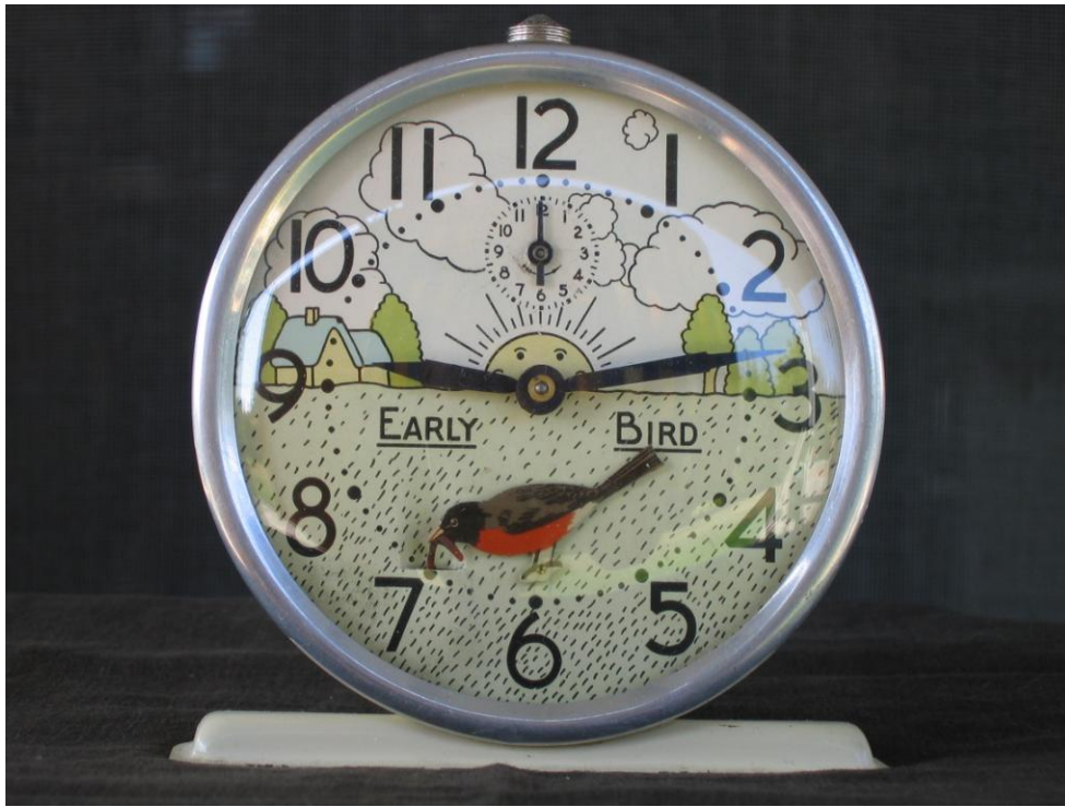
EARLY BIRD by Westclox