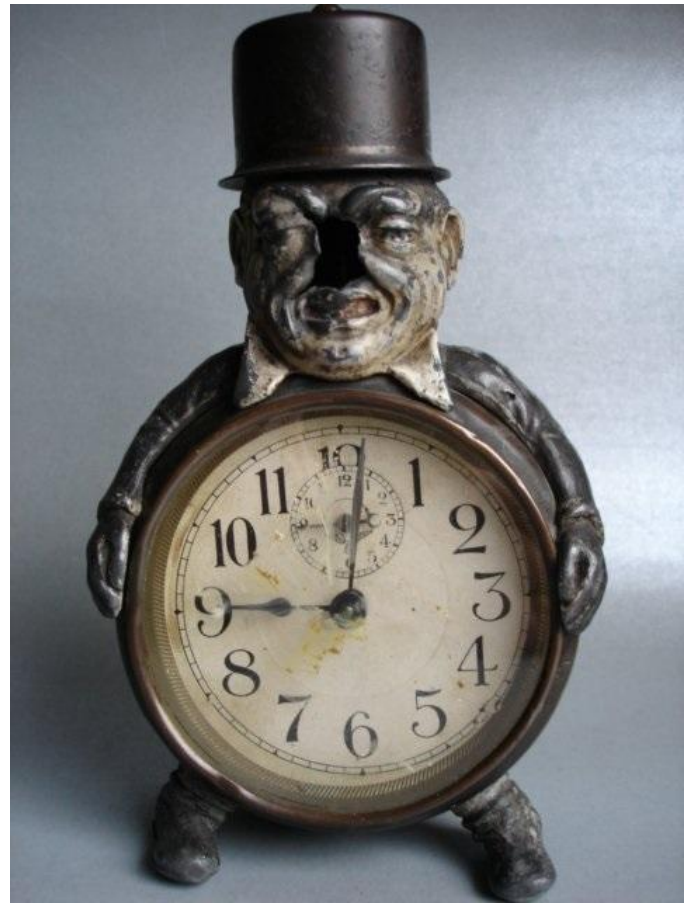
Picture of the Clock as purchased Note the missing nose