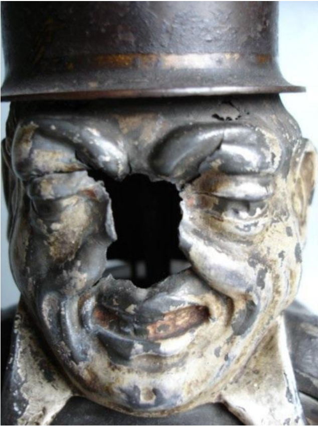
Close up of the face, Note the missing nose