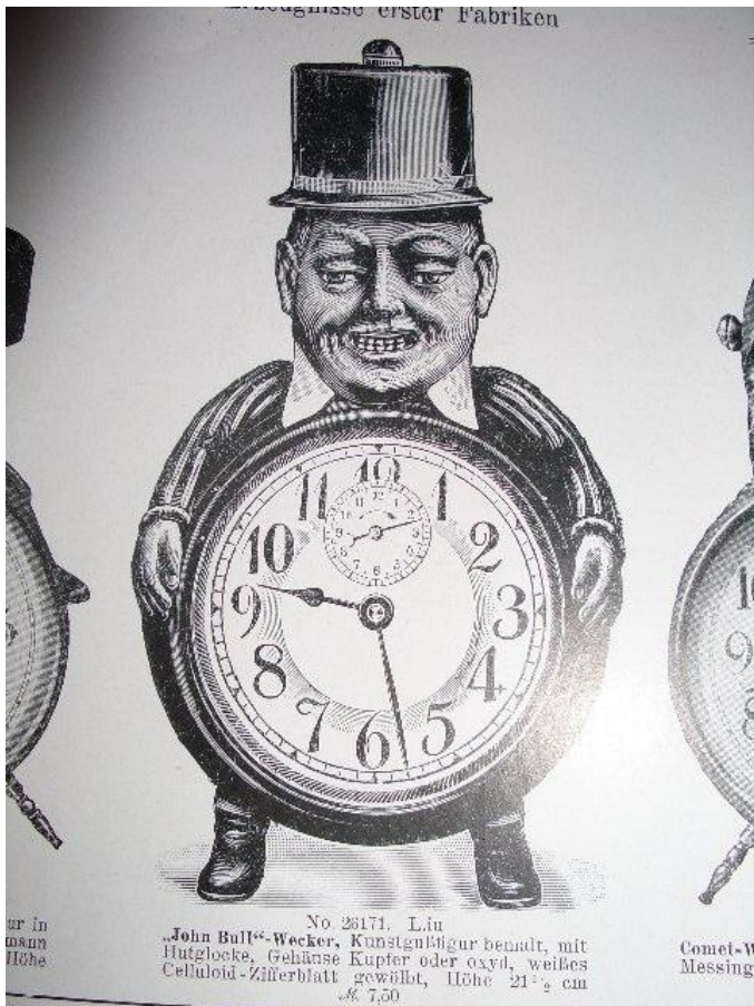
Catalog Pix of the John Bull Clock