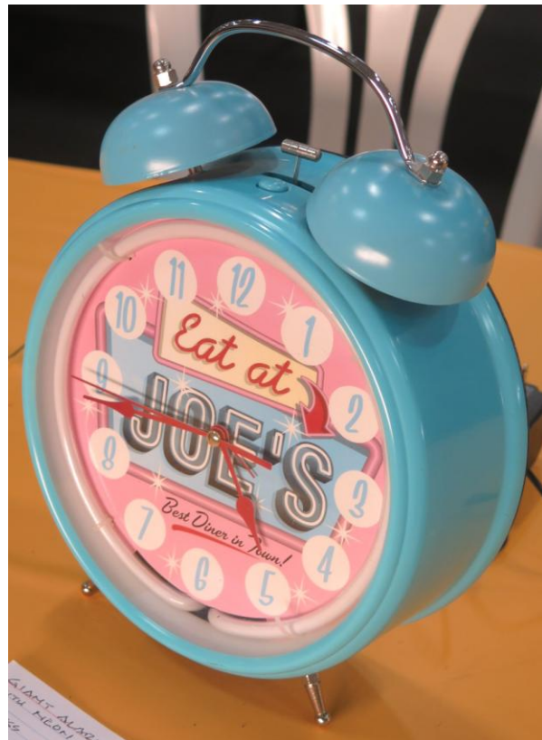
A great alarm clock!!