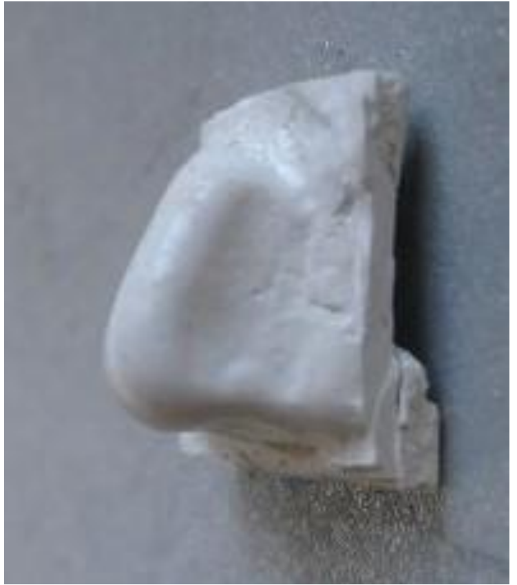
Replacement nose that was fabricated