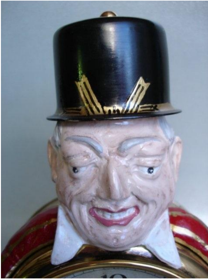
Close up of the face after the repair Note the repair of the missing nose