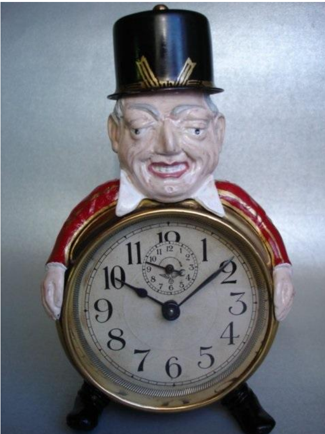
The finished clock