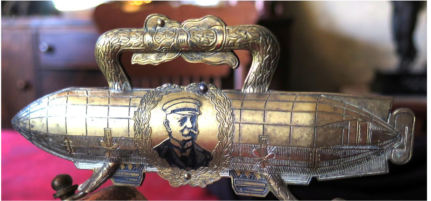
CLOSEUP OF THE ZEPPELIN