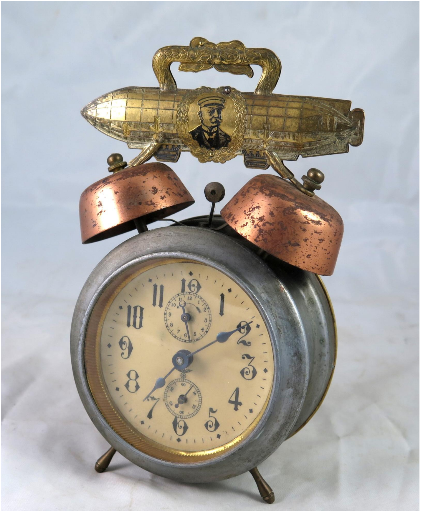
This a picture of the rare Zeppelin alarm ( possibly the only one in existence today)