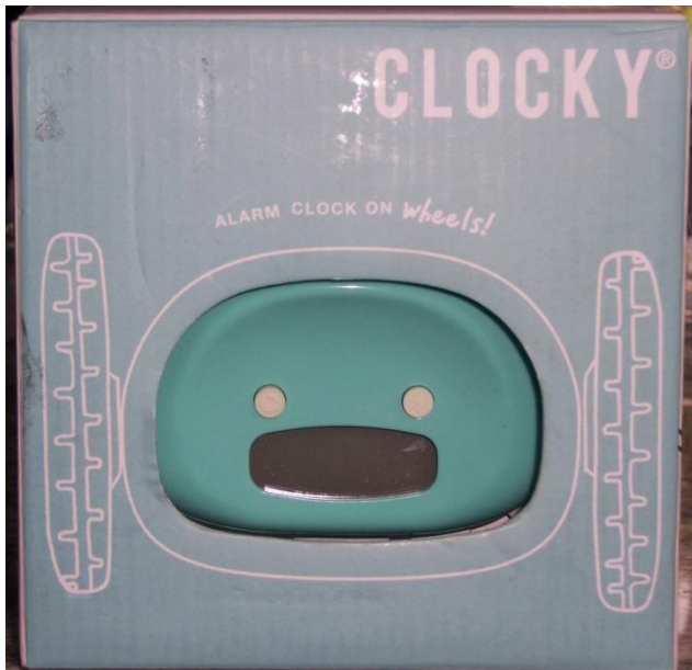
Clocky in her original package

The devise functions as a regular alarm clock except that it moves on its own power when the alarm goes off. A microprocessor built into the unit ensures that the alarm will move in a random pattern and at varying speed, around obstructions till it is found and silenced.