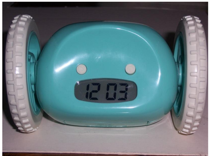
Clocky setting on a night stand ready to jump off and go hide