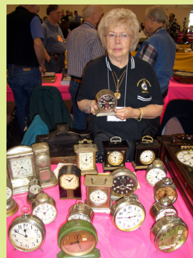
All for Sale. ..