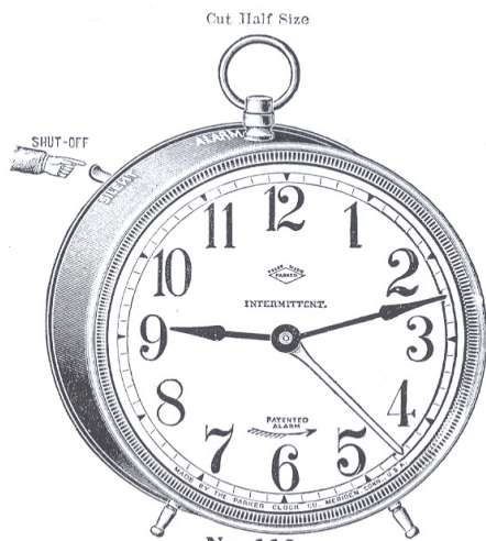
No. 110 Dial, 4 1/2 inches. Height, 5 1/2 inches

THE movement has all the dependable qualities of all regular high-grade Parker Alarm Clocks; cut steel pinions, springs outside the plates, etc. Equipped with large 4-inch gong; rings intermittently every fifteen seconds for several minutes; simple and direct shut-off. Movement easily removed from dust-proof case. Simple, efficient, accurate and durable.