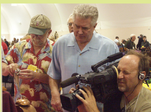
Huell Houser filming Alarm Clock Display

As stated above, four new members were signed up at this regional. We feel that having a display in the Mart Room and being readily available to talk with the attendees is a much better and successful way to attract new members rather than having a separate off-site meeting where only a few HBACC members and practically no non-members attend.