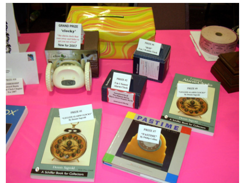
Prizes for the HBACC drawing