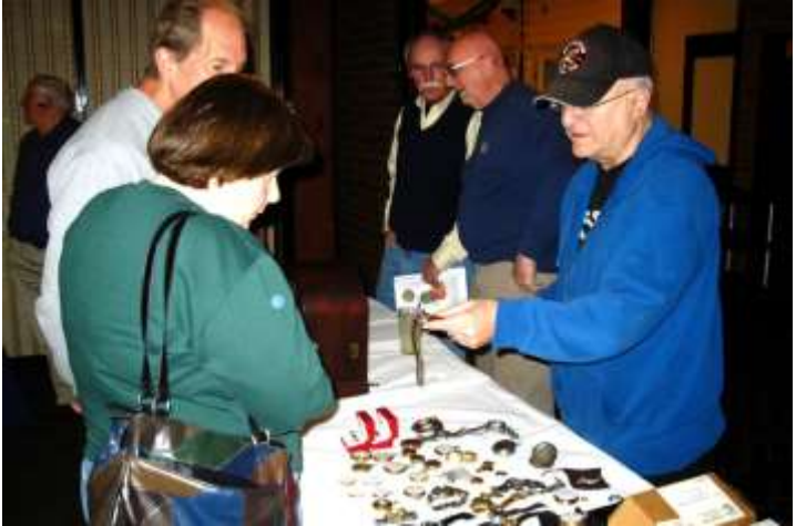
MART Action at November 13 Meeting!

Members submitting information for posting will need to provide the information in a form that can easily be conveyed to NAWCC Headquarters for editing, printing, and distribution. It is not intended that any editing will be required for information you submit. The information should be submitted in Microsoft WORD file format as a .doc or .docx file by email to albushWLIVE@hotmail.com . This email address will be checked for input when the newsletter is prepared to send to press. If you do not have access to a computer, I suggest you contact a friend and seek their help to prepare and email the posting for you. Sample postings to give you an idea of what can be posted in a 2x3½" space were given in the June-July issue of this newsletter. Effort will be made to maintain your posting, wording and presentation as you have submitted it.