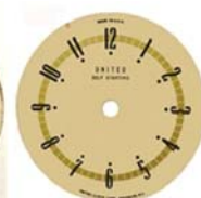
ANIMATED UNITED CLOCK