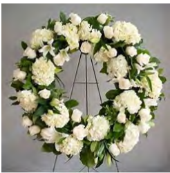
Olga D. Edwards February 6, 2019 at the age of 91

Enclosed is $_____ for _____ people ($14 per person) I have enclosed $10 for my 2019 Dues