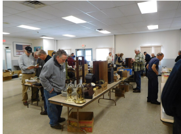
Checking out the Mart & Auction Items!