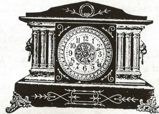
No. B5288. MANCHESTER. $10.70