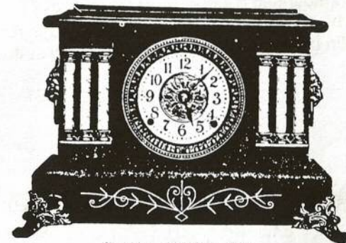
No. B5291. EVERETT. $9.50