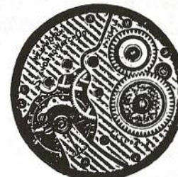
12 size, No. 170

Any watch or clock that has an unusual escapement.