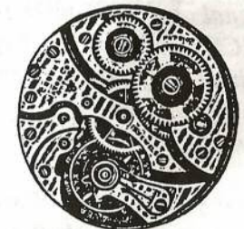
12 size, No. 1512