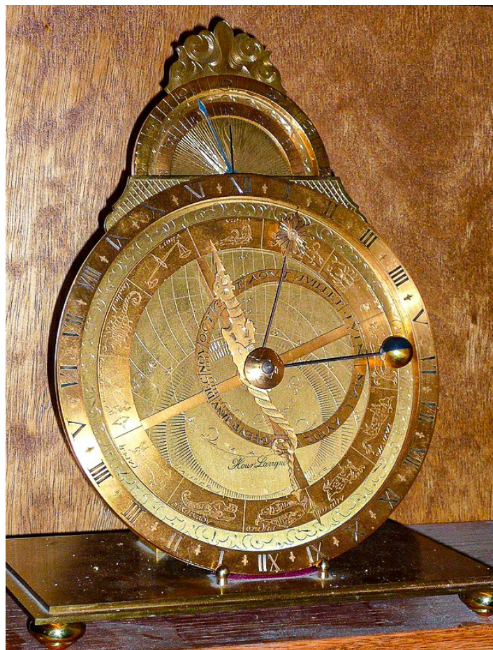
An Astrolabe model from Jim Powell's collection.