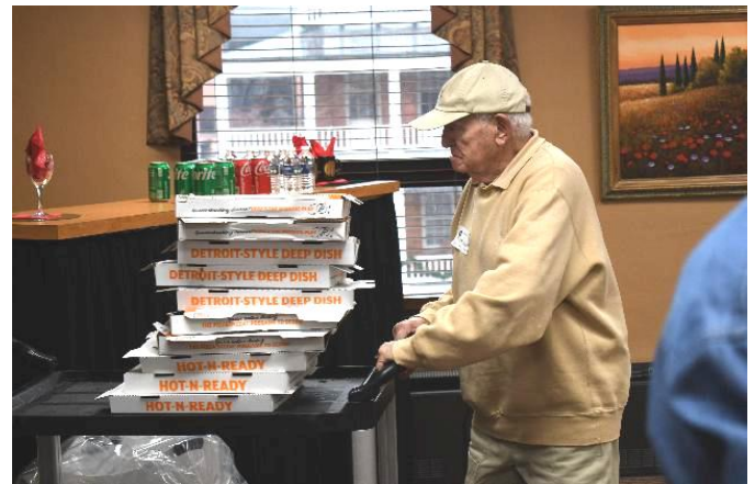
Twelve Pizzas Gone