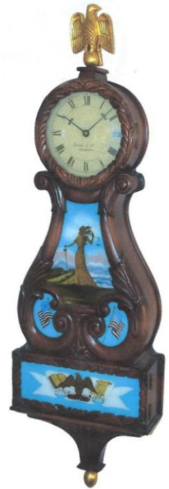
Romeo/Eurich Bicentennial Clock