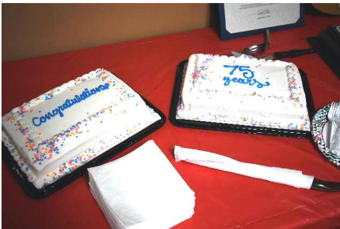
Chapter 75 th Anniversary Cake