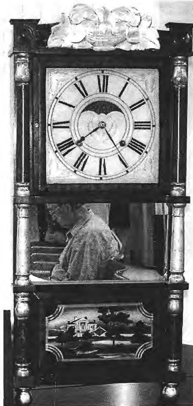
The eight-day Birge and Mallory clock, to be auctioned at the October 10 chapter meeting.

We are grateful to the Community Center staff, whose hospitality is vital to our chapter as well as to other organizations.