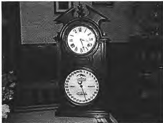
Ithaca No. 8 Library Shelf Clock

Bidding will begin at 10.00 a.m. and conclude at 1:30 p.m. on Friday, March 27. The bidding is open to all registered regional attendees.