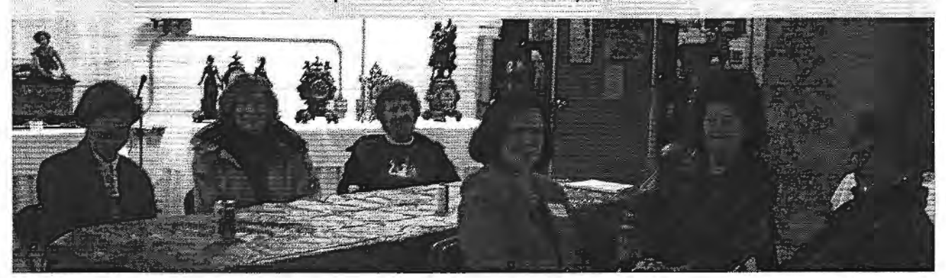
Smiles and good fellowship were plentiful as members gathered for the holiday covered dish social at Shawnee Woodwork in Topeka, Kansas on a cold but sunny Sunday, December 16th