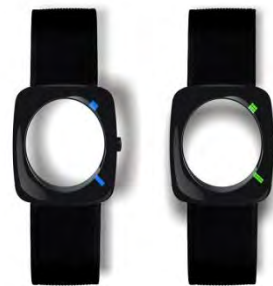
The No Face Watch