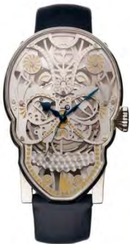
The Skull Watch

Some interesting watches now on the market: