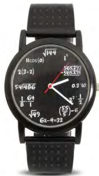
The Geek Watch